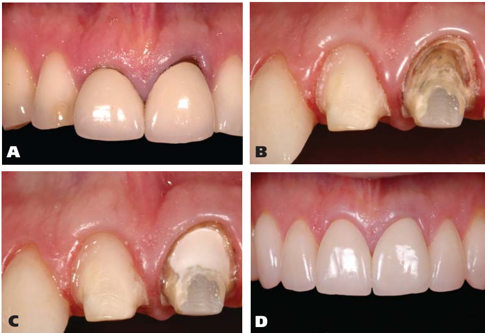
Figure 4. A. A patient needing veneer restorations to restore the worn lateral incisors and canines and crowns to replace the central incisor crowns. B. The cervical portion of the tooth preparation has been prepared an additional 0.3 millimeters to allow for opaque composite to be placed. C. Even though an opaque layered zirconia crown is used, opaquing the cervical portion prevents the dark preparation from showing through. D. The final restorations are sintered feldspathic veneers on teeth nos. 6, 7, 10 and 11 and layered zirconia-based crowns on teeth nos. 8 and 9.

and whether the clinician wishes to cement or adhesively bond the restoration.