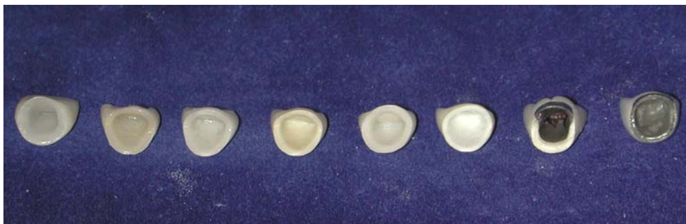
Figure 1. All-ceramic and metal-ceramic crowns. Translucent unlayered (left to right): Dicor (Dentsply, York, Pa.; no longer on the market), IPS Empress Esthetic (Ivoclar Vivadent, Amherst, N.Y.), OPC (Pen-tron Ceramics, Somerset, N.J.). Opaque layered: In-Ceram Alumina (Vita Zahnfabrik, Bad Säckingen, Germany), In-Ceram Spinel (Vita Zahnfabrik), Procera Zirconia (Nobel Biocare, Göteborg, Sweden). Metal-ceramic crown with porcelain labial margin and conventional metal-ceramic crown.

preparations with sub-gingival margins, these patients were faced with the potential risks of recession, exposure of the margin, discolored gingivae and pulpal involvement. These classic metal-ceramic restorations required not only extensive tooth reduction, but a highly skilled master technician to achieve excellent esthetics.