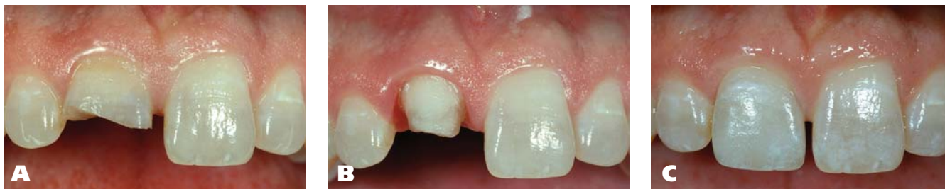
Figure 2. A. A central incisor fractured in an automobile accident without any pulpal involvement. B. The remaining tooth preparation is between 2 and 3 millimeters in height. C. The final restoration is a translucent unlayered (pressed ceramic) crown bonded to achieve acceptable retention.

crown or bridge restorations, while they can use translucent materials for full-coverage or more conservative partial-coverage bonded restorations. We can best summarize these differences as esthetic but weaker versus stronger but more opaque, a dichotomy that drives the process of selecting all-ceramic materials. 12